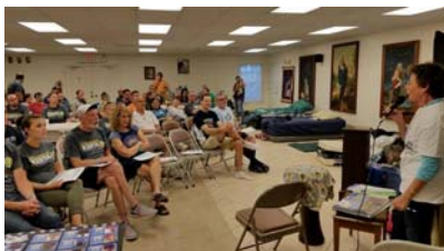
FROGG made Presentations to the following organizations this past quarter: